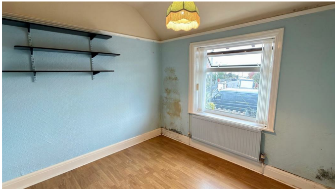
BEDROOM 3 9'3" x 8'7" (2.83m x 2.64m)

Radiator, upvc double glazed window with limited sea views.