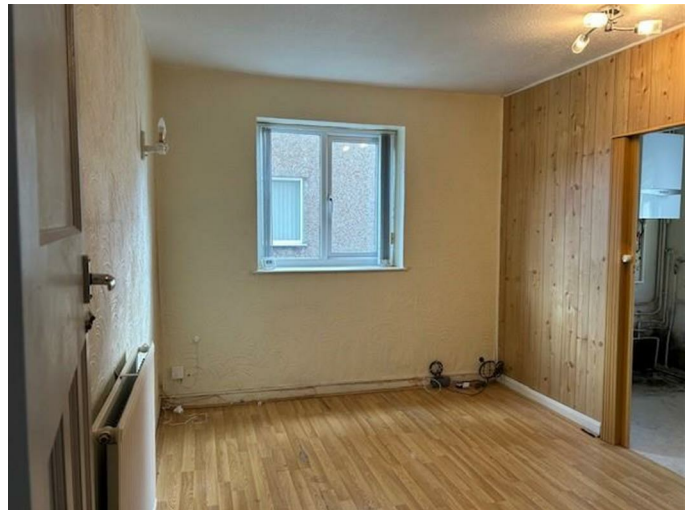
SITTING ROOM 11'6" x 9'3" (3.52m x 2.82m)

Double radiator, upvc double glazed window.