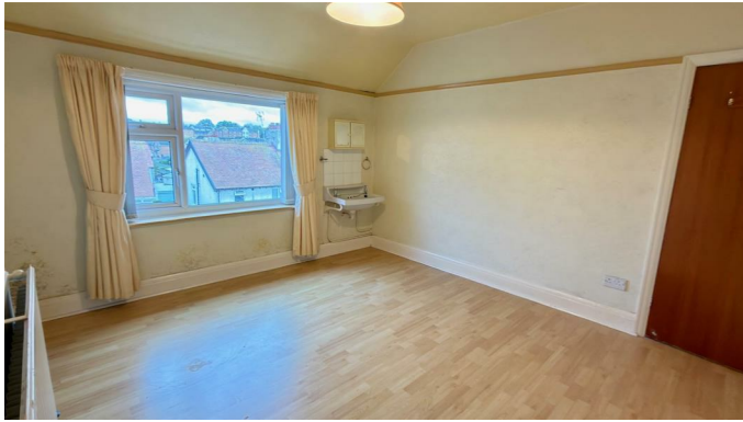
BEDROOM 2 11'11" x 12'10" (3.65m x 3.92m)

Wash hand basin, double radiator, upvc double glazed window.