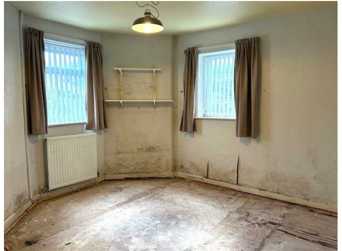
BEDROOM 4 11'8" x 12'9" (3.57m x 3.91m)